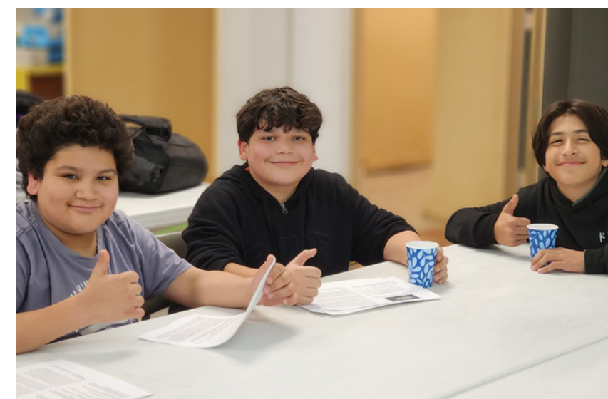
Each Wednesday, nearly 20 students gather at the Argentine Mennonite Church as part of the YF Neighborhood Youth Group. Each week, local teens share a meal, participate in a Bible study (left), and experience community (right).