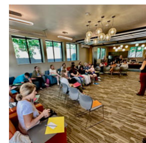
Children's and Family Pastors gathered for a mini-retreat