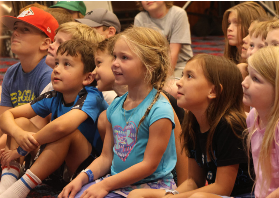
The theme for Youthfront Camp in 2023 was “Seeking God’s Dream.” Day Campers learned about God’s Dream (God’s Kingdom) as they explored five of Jesus’ parables covered each day of camp and in their Day Camp Family Journals.

This year, the initiative has also supported multiple gatherings of and trainings for Children’s and Family Pastors, Youth Worker Training events as well as the launch of parent/grandparent cohorts speaking into the resources developed. The Spanish-speaking parent cohort has provided unique insight into the needs of the parent/caregiver and church community needs in the neighborhood of Argentine, Kansas City, KS.