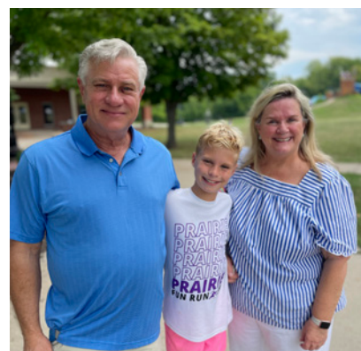
Grandparents were invited to visit camp during select weeklong sessions.