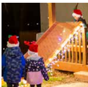
Christmas at Camp will be Youthfront's main fundraiser