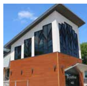
Youthfront celebrates staff transitions as ministry grows