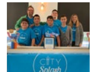
Students present "City Splash"