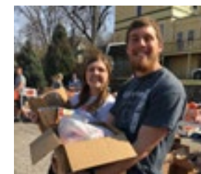
Volunteers distributing food